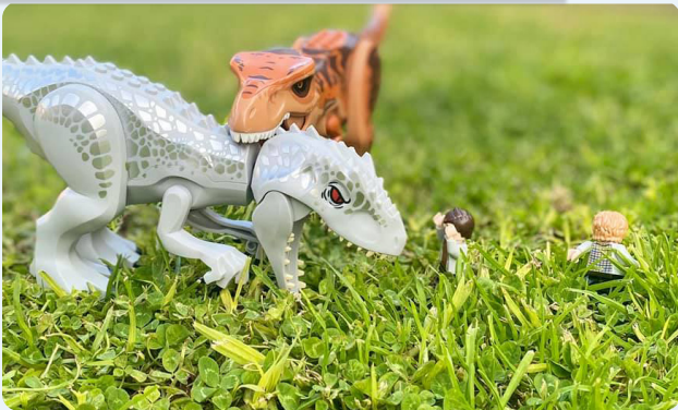
Photograph by Dylan (6)