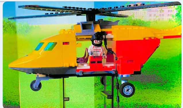
Photograph by Clay (8)