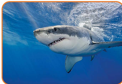
Great White Shark