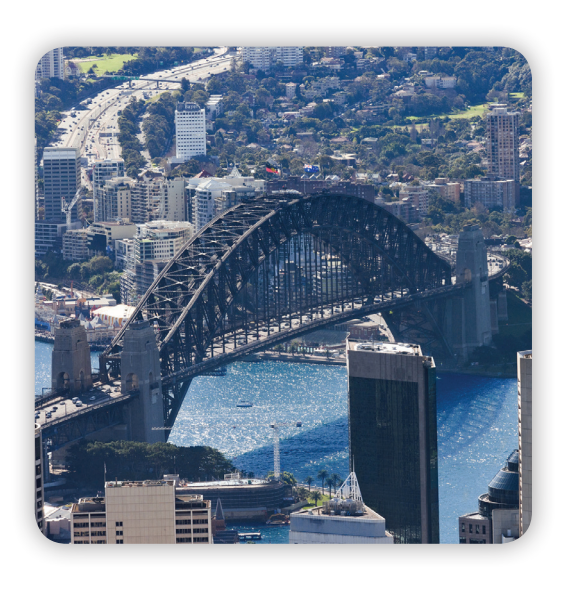
Sydney Tower Eye Sydney Opera house

The Sydney Tower Eye is twice the height of the Sydney Harbour Bridge!?